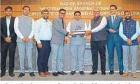
नाशिक : सीए इन्स्टिट्यूटच्या नाशिक शाखेतर्फे आयोजित कार्यशाळेसंगी उपस्थित मान्यवरांसह स्थानिक शाखा पदाधिकारी.