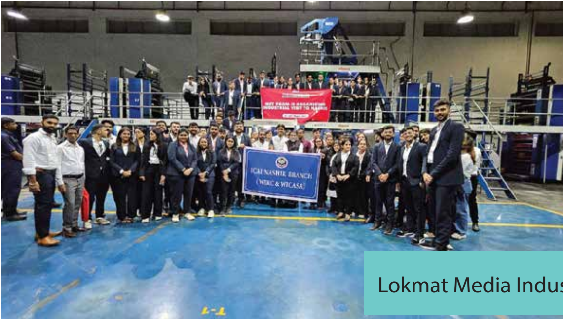
Lokmat Media Industrial Visit