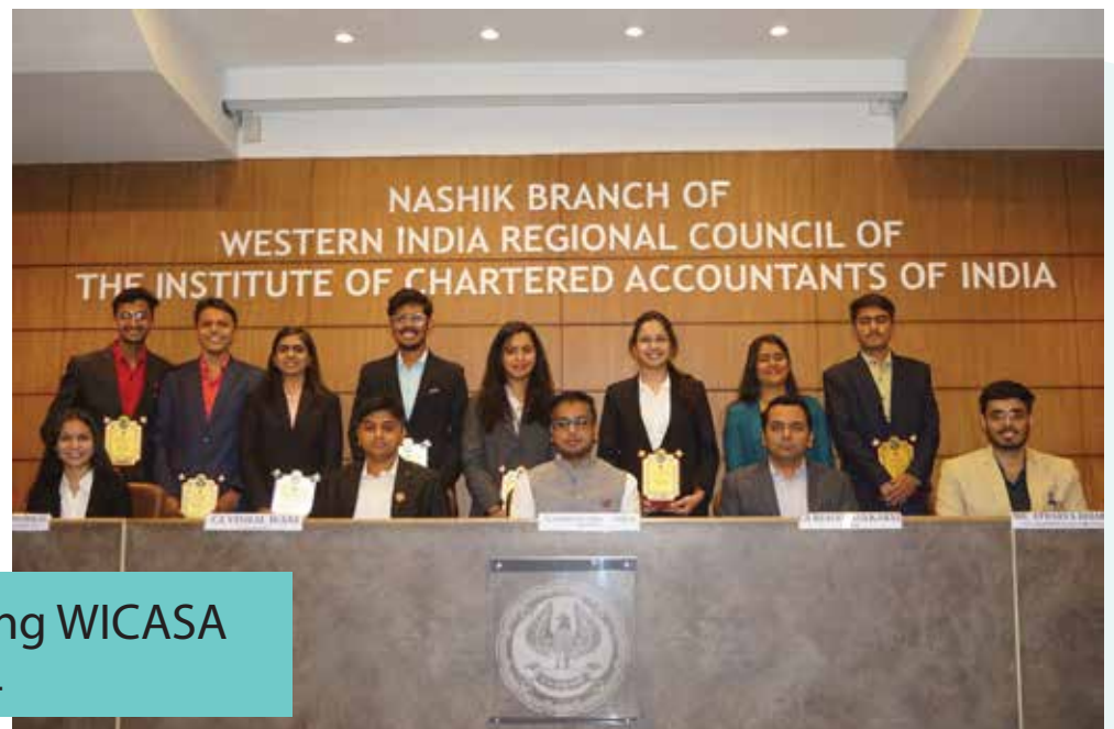
Felicitation of Retiring WICASA Committee 2023-24