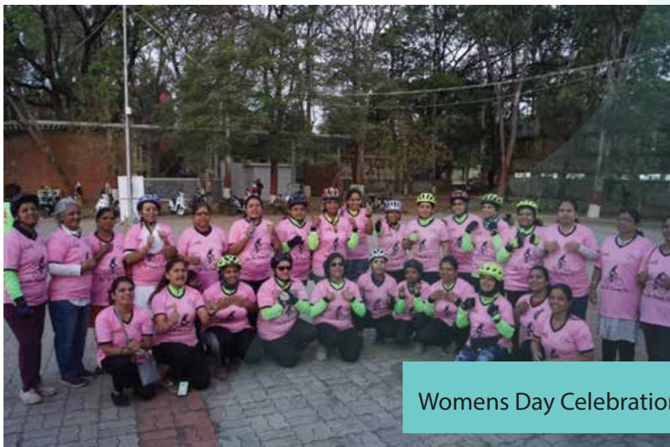
Womens Day Celebration