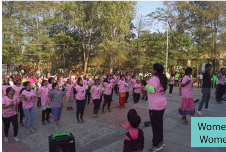
Women's Day Celebration - Women Cyclothon