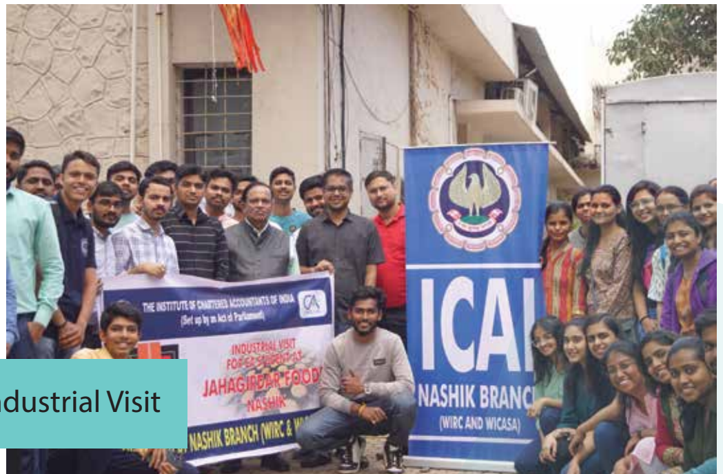
Jahagirdar Foods Industrial Visit