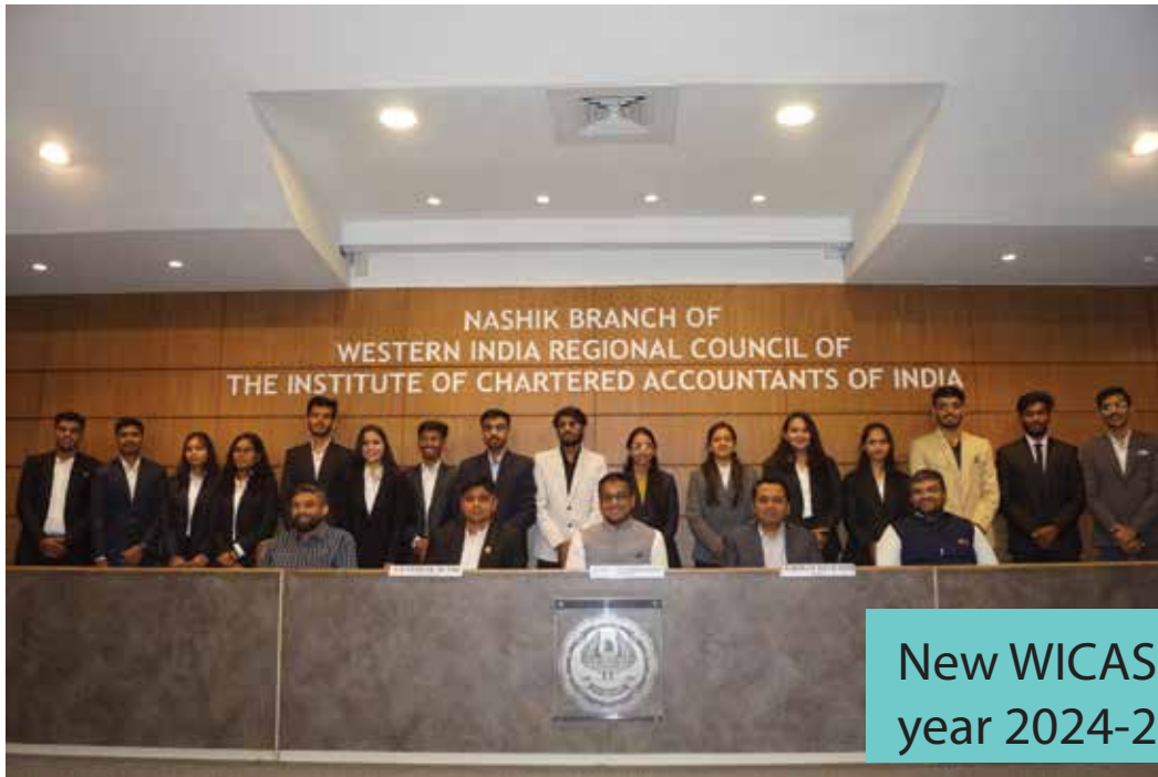
New WICASA Committee for year 2024-25