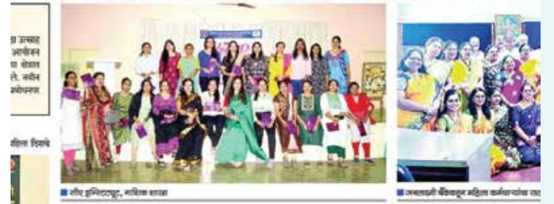
सीए इन्स्टिट्यूट, नाशिक शाखा

शहर परिसरात महिलादिनानिमित्त सत्कार, रॅली,